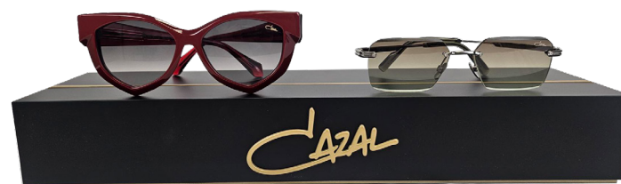
OPTION B – 2 Piece Riser