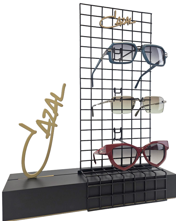
OPTION A – 3 Piece Display